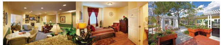
Intimate & Inviting floor plans